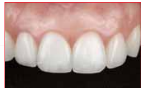
Clinical case courtesy of Dr. Iñaki Gamborena

We're a one-stop shop for products, training and clinically documented treatment concepts. We supply leading-edge implant systems. And we're the only company to offer a complete service from start to finish – one seamless procedure using